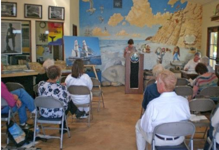
Readers await their turns while others listen and enjoy the narrative.