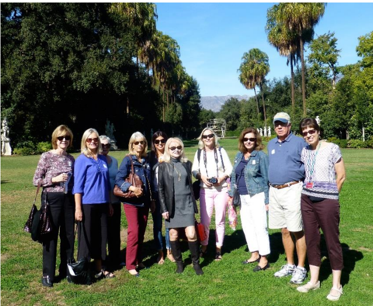
One of the three tour groups pauses in the beautiful English Garden with their guide, right.

Our November 22 trip to the Huntington Library and Gardens proved a fun (and exhausting!) trip. There was so much to see that half a day was not nearly enough time. We started our day with a comfortable bus ride after which tour guides met us at our bus stop. We then separated into three groups and embarked on an extended tour of the grounds with our guides stopping in shady spots to describe how Henry Huntington's San Marino ranch became today's impressive library, art museum and gardens. Lunch and our choice of exhibits completed the afternoon. Numerous members commented that they will want to return to see the many exhibits and gardens we didn't have time to visit.