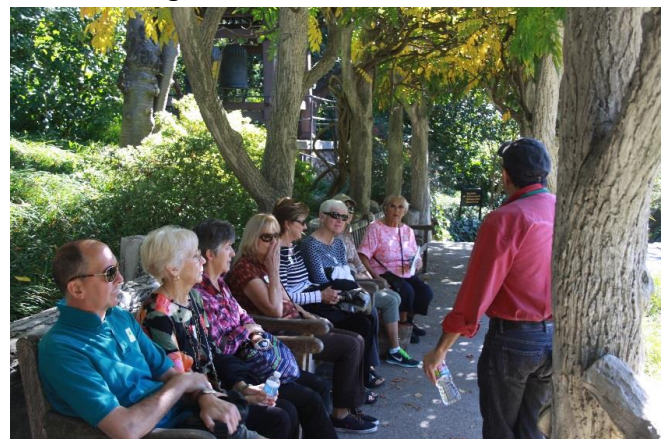
Another tour group pauses to relax and listen to their informative guide, right..