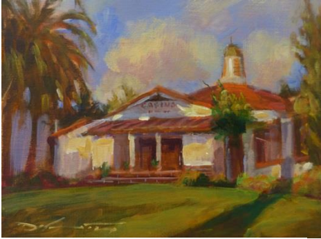
Painting by Rick Delanty

Our first fall meeting is to be a highlight for 2013! San Clemente Casino, located just over the line in North Beach, is less than a 15-minute drive on PCH. Casino San Clemente is just six miles from City Hall and we will still have daylight to see the restored casino, patio and gardens. Program chair, Ann Shultz, writes the details below: